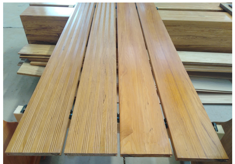
Available as smooth or ridged surface