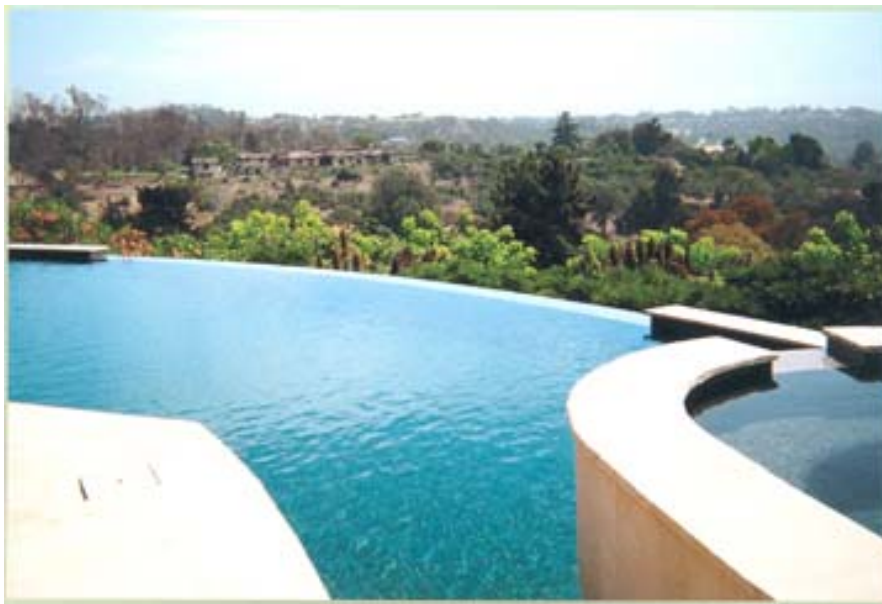
No scale forms, no hard water lines occur with ECOsmarte

Pool owners who may be away from their home for extended periods may benefit from the Totally Automated System. The Totally Automated System allows the ionization and oxidation cycles to be programmed into the controller, so the cycles turn on and off at the same times each week. This allows the pool to be properly ionized and oxidized while you are away from home.