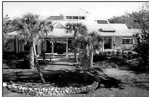
The non-profit Florida House Institute for Sustainable Development located in Sarasota, Florida, inspired the creation of Eco-$mart Inc.