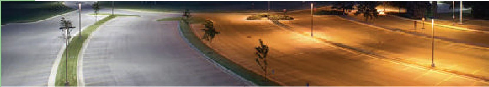
LED LIGHTING ABOVE