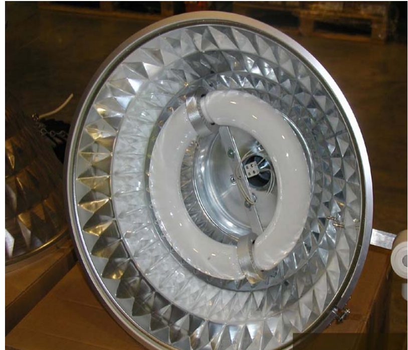
UL Listed, US and Canada

Application: Industrial factory, Warehouses, Stadium, Hypermarkets and other indoor environments