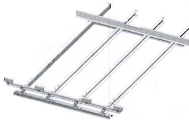
With Pitch Frames (for pitched roofs)