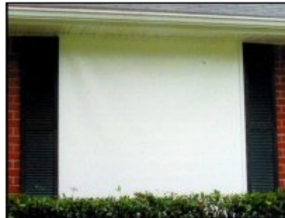
Installed inside the soffit.

Light and easy. just pull down and lock in place.