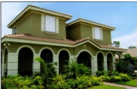
Great for second floor application. Can be opened and closed from the inside.

Highly Effective Storm Protection Against Wind-Driven Debris and Water Penetration