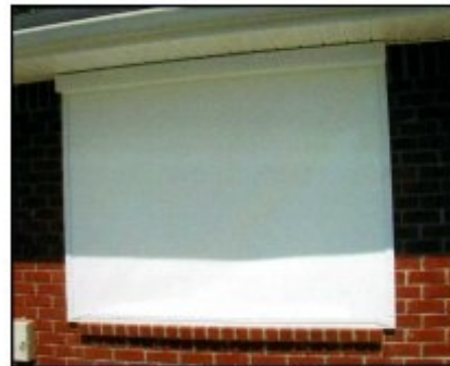
Installed below the soffit.