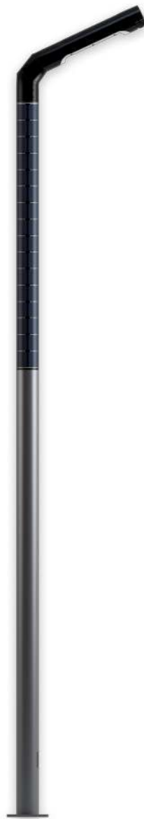
PREMIUM LINE Excel Model