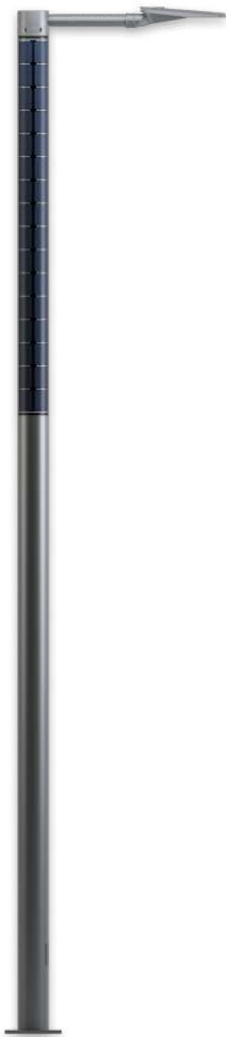
PERFORMANCE LINE Standard Model

The closed and compact construction of our smart streetlights offer reliable performance, even under extreme climatic conditions. All models have PV wrapped around the pole.