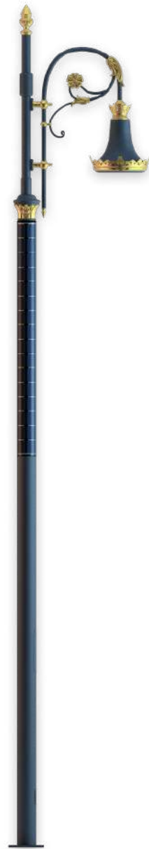
DECORATIVE LINE Regal Model