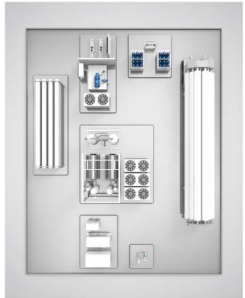
Aerial view render of SHEP's components.